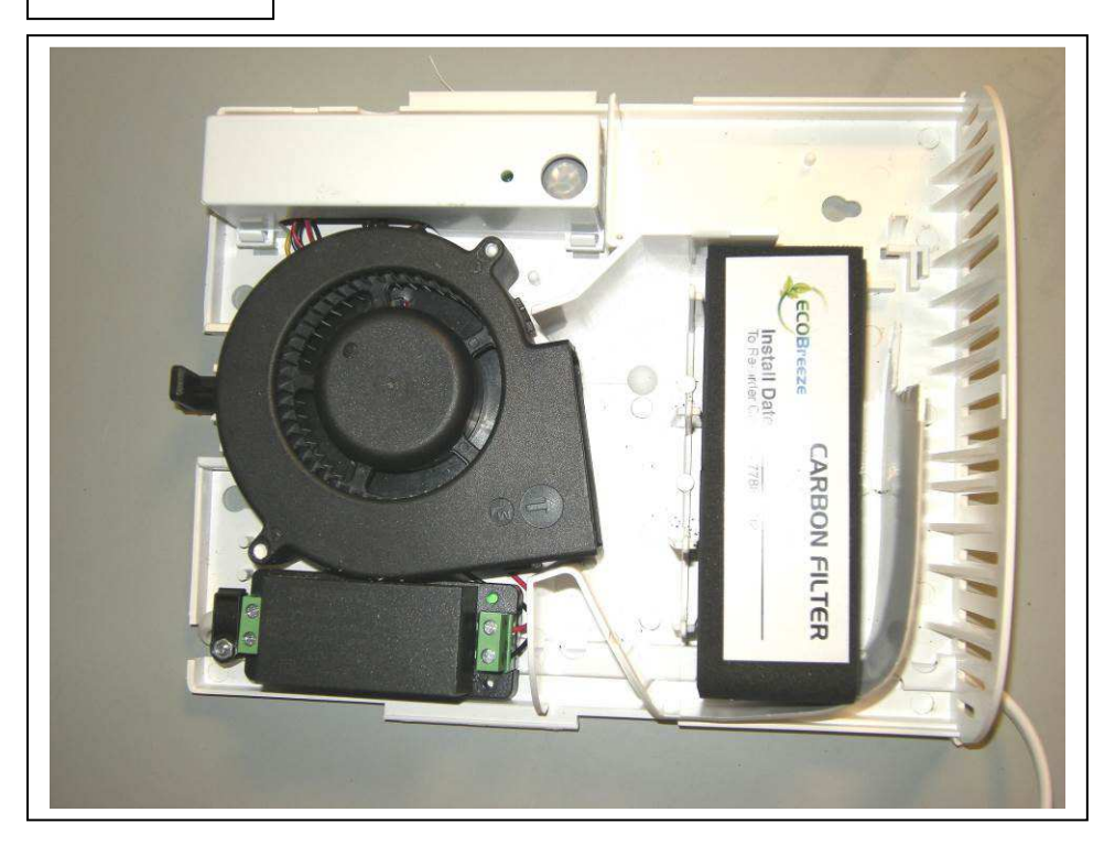
End of report